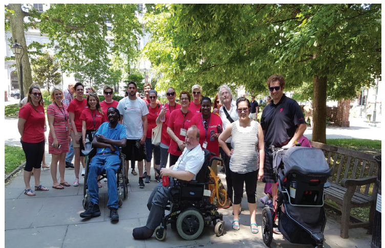
The Philly 2017 ADAPT Fun Run participants catching their breath at Washington Square Park.

On May 14th, National ADAPT held their annual Fun Run in Washington, D.C. They raised $135,000! The ADAPT Fun Run in Philadelphia was held at Washington Square Park. Liberty Resource's raised over $3,500 among about 15 participants! Overall, the event was a huge success, both locally and nationally. LRI is proud of its partnership with ADAPT and looks forward to the continued relationship. ★