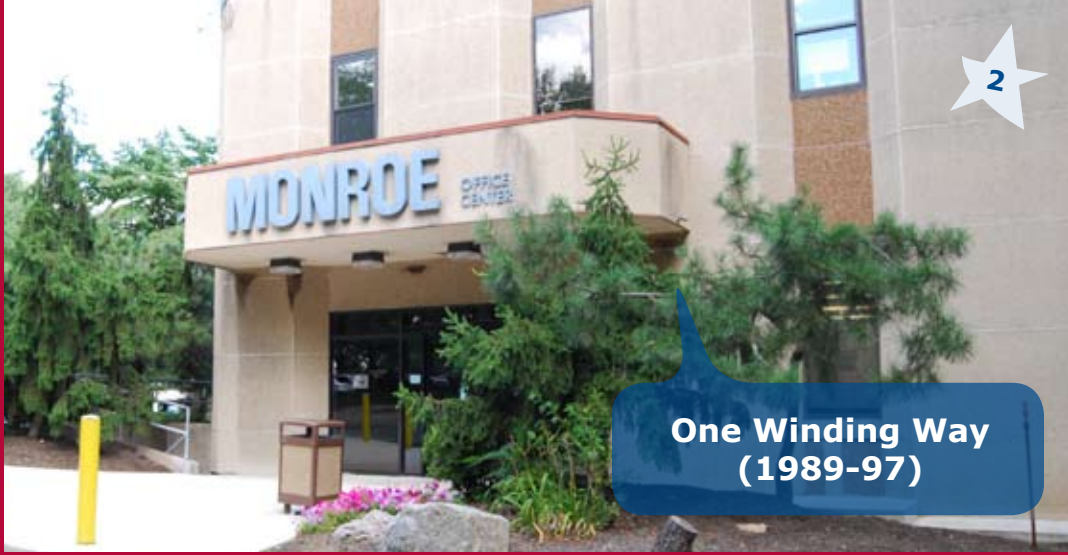
One Winding Way (1989-97)