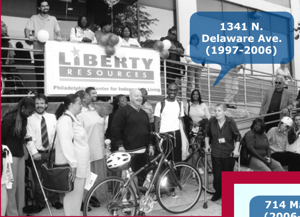
1341 N. Delaware Ave. (1997-2006)