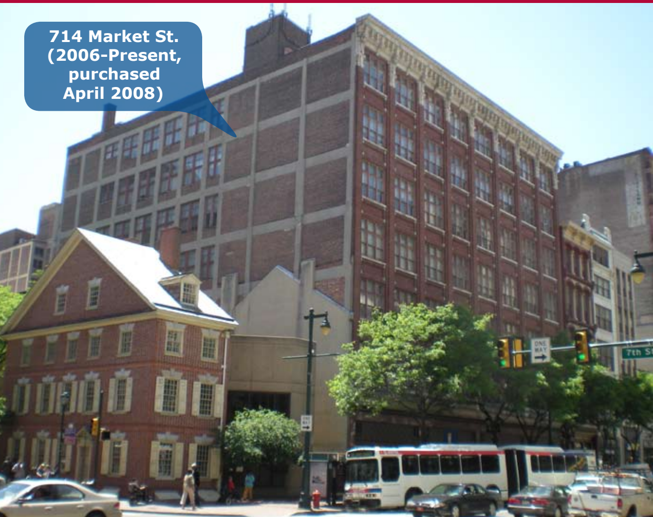
714 Market St. (2006-Present, purchased April 2008)