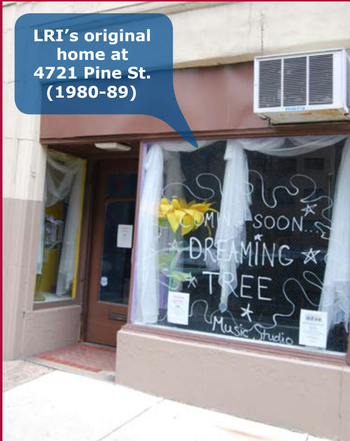
LRI's original home at 4721 Pine St. (1980-89)