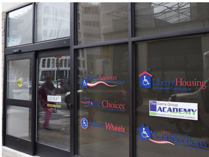
Liberty Resources, Philadelphia Office 112 N. 8th Street, Suite 600 Philadelphia, PA 19107