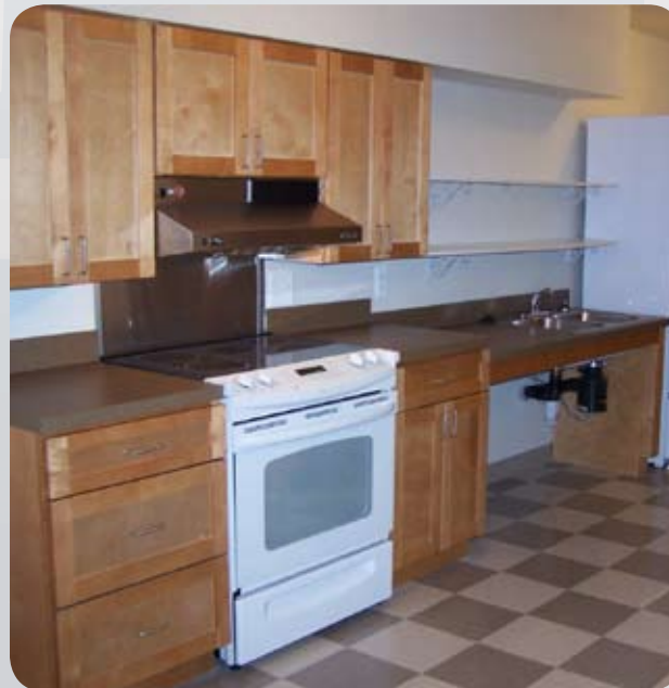
Accessible kitchen in an LHDC condo